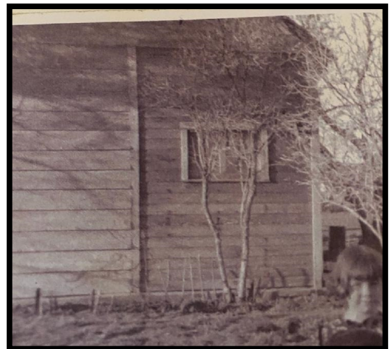
Older frame home built by James Crapo

Delbert was a craftsman and a builder. He added on the east side of the home as a living room and added beautifully made cabinets to the kitchen area. In comparing pictures of the older frame home and the one remodeled by Delbert, you can see the use of the original section on the west. He also annexed an outbuilding on the north to use as a bedroom for some of the boys.