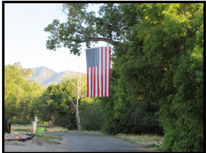
Flag over First North

May God bless America and the great people of Fillmore who remember how great our country is!